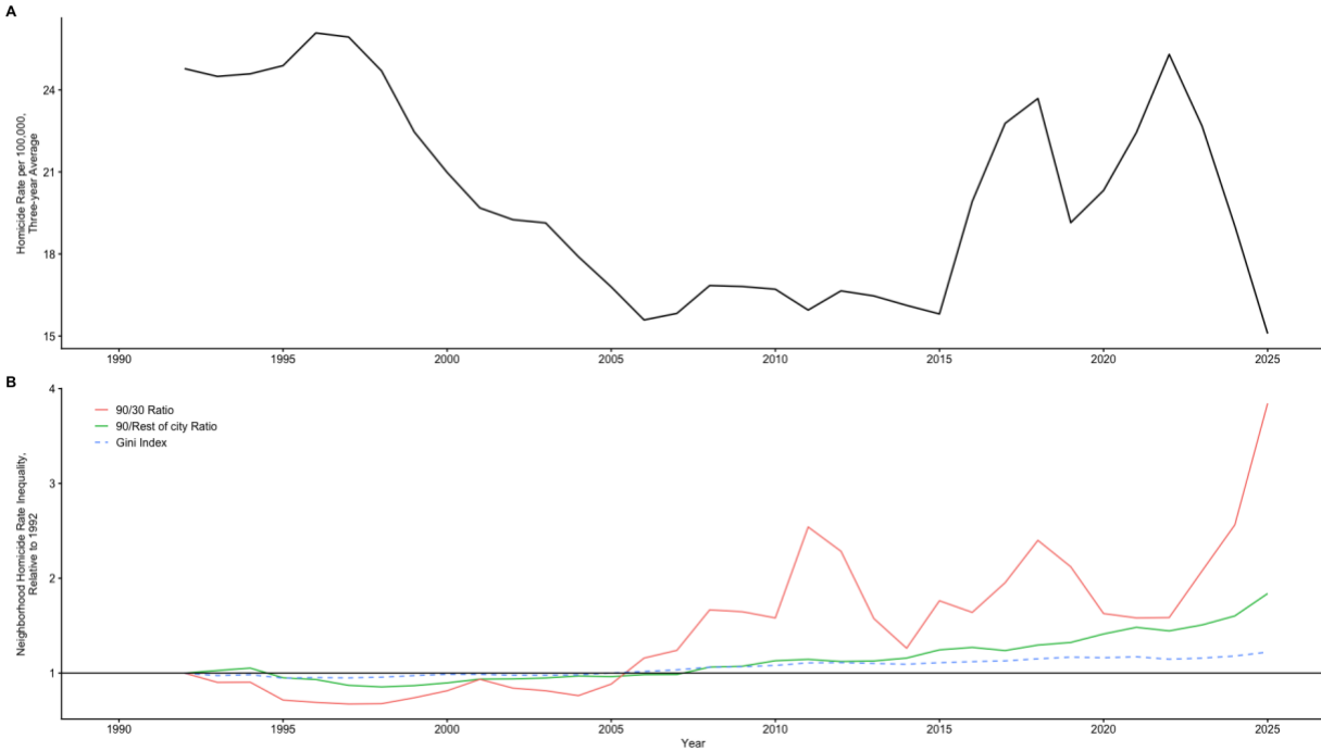
Figure 1. Trends in neighborhood homicide rates and inequality in Chicago, 1992–2025. (A) Citywide homicide rate per 100,000 population. (B) Relative inequality measures indexed to 1992 values: ratio of homicide rates between neighborhoods in the top 10th percentile and the bottom 30th percentile (90/30 ratio); ratio of top 10th percentile to the rest of the city (90/rest ratio); and Gini index.